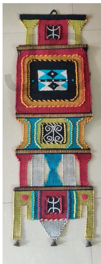
Fig1: Solapur Wall Hanging