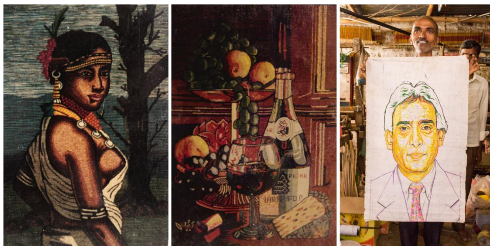
Fig 2: Contemporary wall hanging designs of Solapur