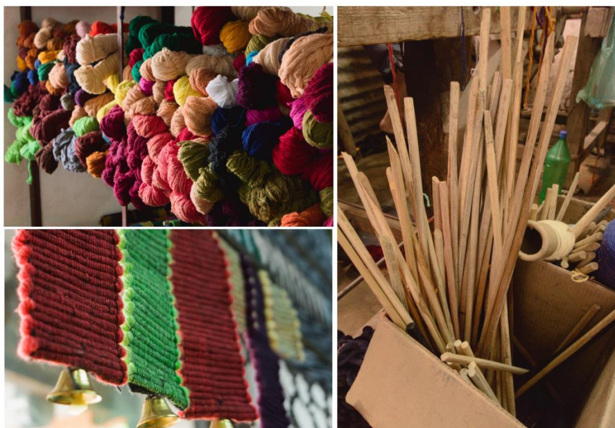
Fig 3: Raw materials used for making Wall hanging: Yarns, Patti and Bells